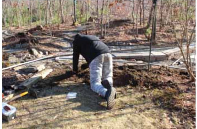
Nephew Trenching for conduit