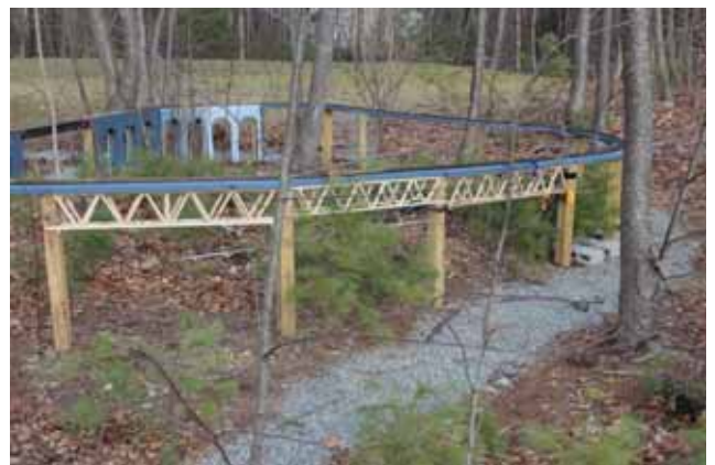
Truss bridges 54, 48, 54 inch.

With some luck and a lot of work, the Rangeley Lakes branch may even be operational by June.