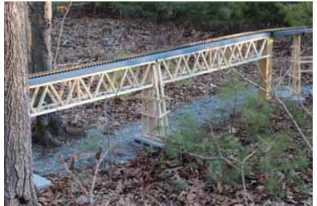
Truss - 10 foot span fully supported by truss & bents.