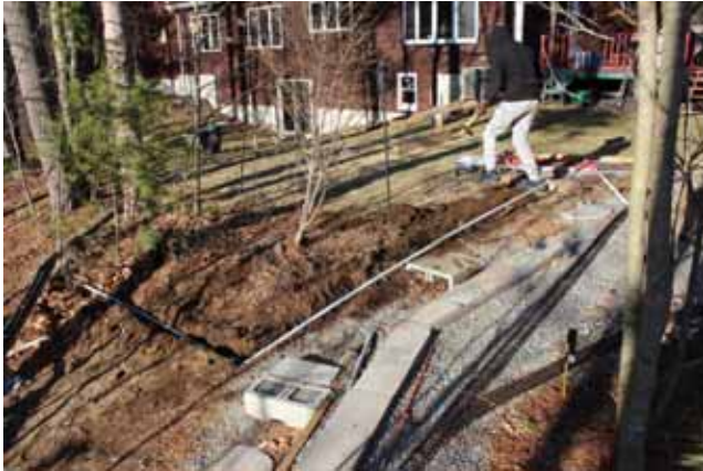
Conduit for the main power feeds.

In the meanwhile work continues on the Stoneman & Turkey Divide Railroad. I've mapped out what should be about a 200 foot expansion of the railroad and this will be an almost virtually separate branch with two connection points to the existing track.