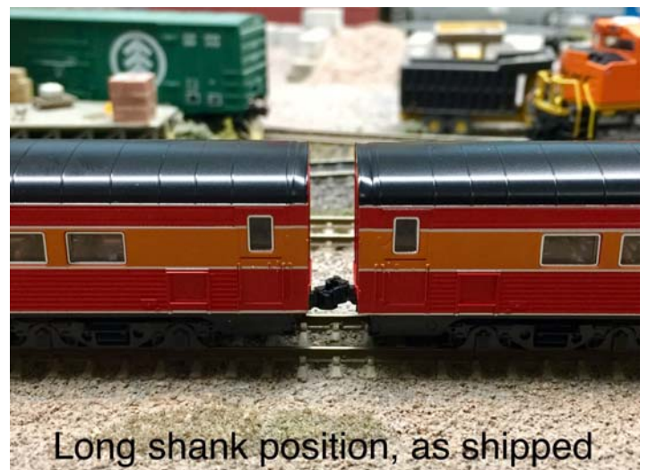
Long shank position, as shipped

I know that several club members have this equipment, so I thought I would point out the options you have to operate them, just in case you're unaware like I was. (continued on page 2)