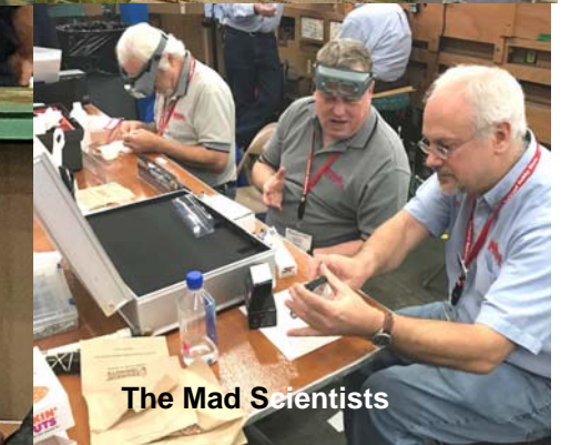
The Mad Scientists