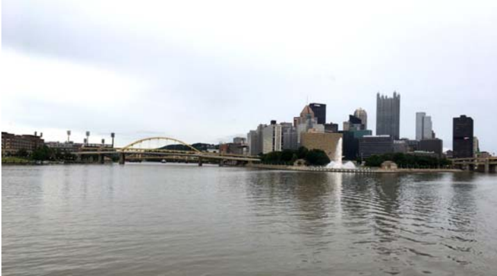
Gateway Clipper River Cruise

The evening was capped off by a dinner-boat ride up and down the three rivers of Pittsburgh (Allegheny, Monongahela and Ohio).