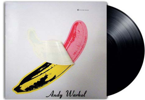
Velvet Underground LP (album art by Andy Warhol)

Every attendee received a Micro-Trains special run car - a pickle in a gondola. Very surreal. It seemed like it belonged on the cover of a Velvet Underground LP.