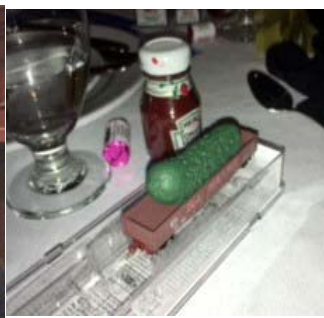
Micro-Trains special run car - a pickle in a gondola

Every attendee received a Micro-Trains special run car - a pickle in a gondola. Very surreal. It seemed like it belonged on the cover of a Velvet Underground LP.