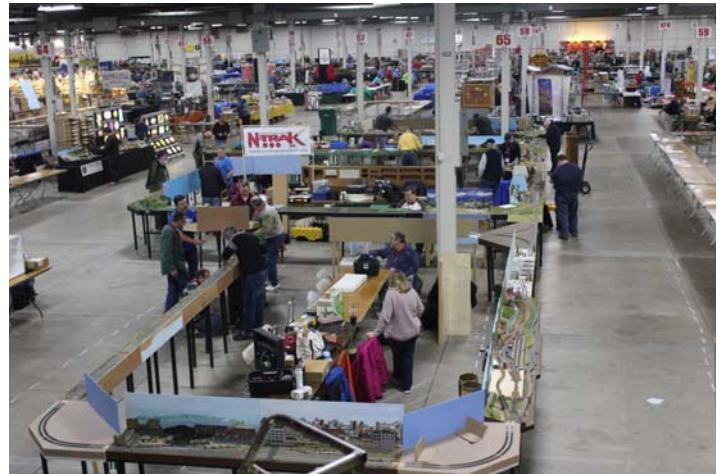
Layout in the Better Living Center.