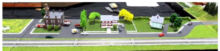
Ice Cream Truck by Pat O'Conner