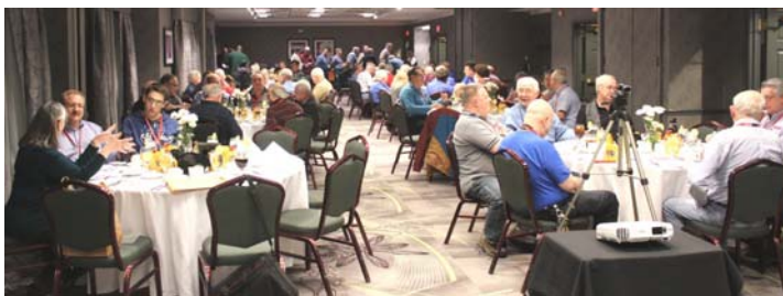
Banquet on Saturday Night.