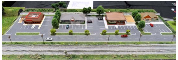
Restaurants by Phil Brown

There were so many quality modules, it was hard to judge. If you did not have a chance to see the T-TRAK layout, I have included a few photos below: