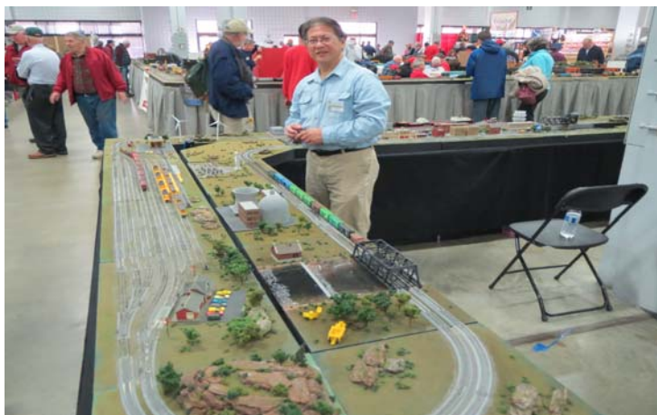
I was there as a guest of MaiNe Track. They had members from their club and from Montreal displaying. Here are a few of their modules at the show.