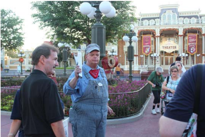
The next time you visit Walt Disney World, walk around inside the station and take a few minutes to read the posters, captions, and notes about Walt Disney's railroad and the people who helped make it happen.