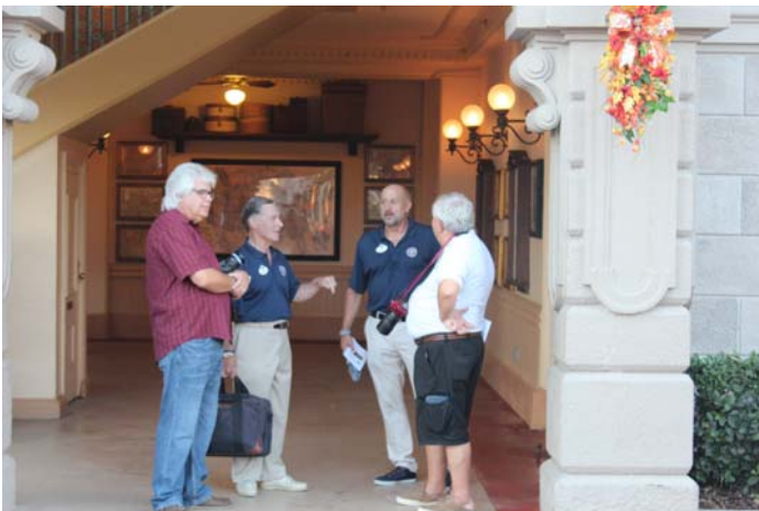
Most people just zip right through on their way in and out of the park, but there is a lot of history on those walls.