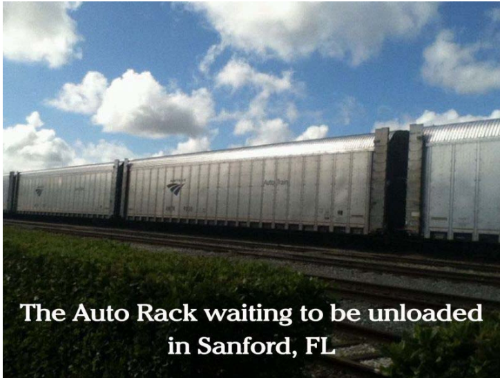
The Auto Rack waiting to be unloaded in Sanford, FL

What train travels 855 miles over 17 hours and your plus one is your car? If you have not guessed, it is Amtrak's Auto train. The train is 1/3 of a mile long with 3 engines and over 46 cars making it the longest passenger train in North America. The train includes the 3 engines, 4 crew cars, 17 coaches or sleepers, and 25 autoracks carrying 650 people and 330 cars. The train runs from Lorton, Va., just outside Washington DC to Sanford, FL., outside Orlando daily. Today, Amtrak's Auto Train carries about 200,000 passengers and generates around $50 million in revenue annually. It is considered Amtrak's best-paying train, being the top of a handful of Amtrak trains that make a profit.