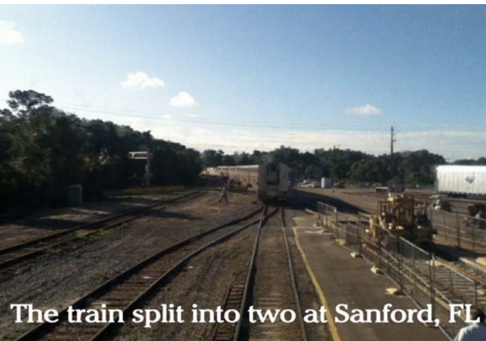
The train split into two at Sanford, FL

What train travels 855 miles over 17 hours and your plus one is your car? If you have not guessed, it is Amtrak's Auto train. The train is 1/3 of a mile long with 3 engines and over 46 cars making it the longest passenger train in North America. The train includes the 3 engines, 4 crew cars, 17 coaches or sleepers, and 25 autoracks carrying 650 people and 330 cars. The train runs from Lorton, Va., just outside Washington DC to Sanford, FL., outside Orlando daily. Today, Amtrak's Auto Train carries about 200,000 passengers and generates around $50 million in revenue annually. It is considered Amtrak's best-paying train, being the top of a handful of Amtrak trains that make a profit.