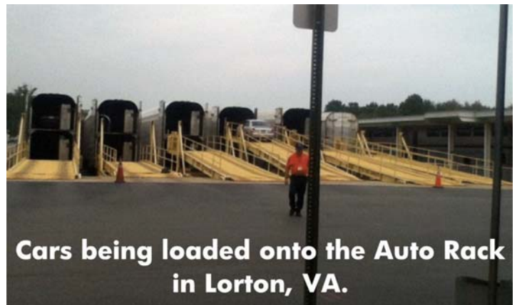
Cars being loaded onto the Auto Rack in Lorton, VA.

Kentucky, and Sanford, Florida. The Auto-Train included passenger cars, autoracks, and a caboose. The company had its own locomotives and rolling stock. Lack of success from the Louisville expansion, high crew costs and several accidents put company into bankruptcy. Auto-Train Corporation was forced to end its services in late April 1981. Operating for almost ten years, Auto-Train had developed a popular following, as it ferried passengers and their cars between Lorton, Virginia, and Sanford, Florida. No one else offered a service quite like that of Auto-Train Corporation until, after a gap of almost two years, service was revived by Amtrak (the National Railroad Passenger Corporation), a federally chartered corporation which operates most intercity passenger trains in the United States.