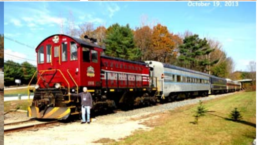
At the Common Man Inn in Plymouth, NH