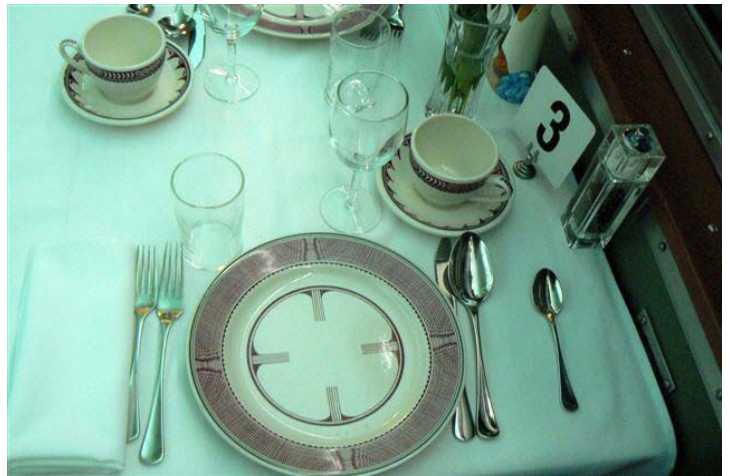
The southwestern motif runs the length of the car above the windows (Photos bottom left column). The counter seating got me thinking of pie a la mode and a coffee, although for a full meal I like a forward facing seat to also enjoy the scenery on both sides of the train.

Epicurus This car was built in 1950 for the AT & SF RR by Pullman-Standard . It ran on the El Capitan between Chicago and Los Angeles. Photo above. "It is the only authentic, privately owned Dining car operating in mainline intercity service (today)." The car has a full galley and two different seating areas.