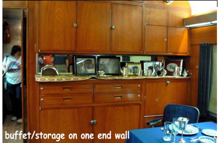
buffet/storage on one end wall