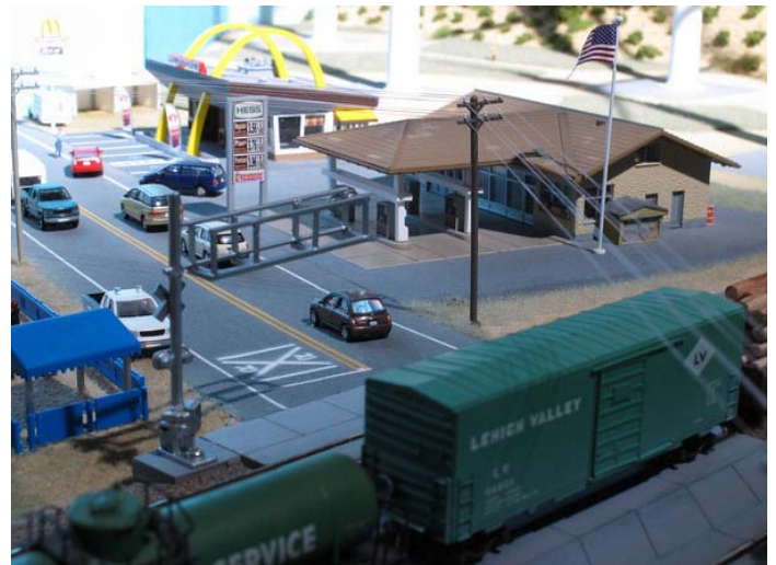
Photo of Toshiyuki Abe's module by Ken Harstine. Train by Frank Dignan

Northeast Ntrak's participation in the South Shore Model Railroad Club's open house was wildly successful. At various times during the two days there were as many people crowded around our 10x14 foot display as there were around the massive HO scale layout we shared space with.