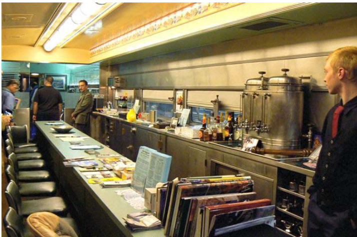
One was a complete surprise for me-- the familiar counter-style layout of a land-based diner. Photo above. Note the coffee brewer and soda fountain equipment. Unfortunately, they were not serving that day.