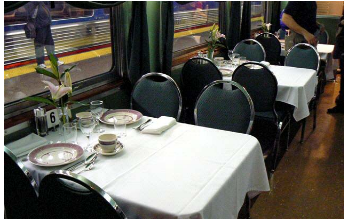
There is also full table service for 36 persons per seating Photo above. Photo below shows the table setting with its specially designed china.

Epicurus This car was built in 1950 for the AT & SF RR by Pullman-Standard . It ran on the El Capitan between Chicago and Los Angeles. Photo above. "It is the only authentic, privately owned Dining car operating in mainline intercity service (today)." The car has a full galley and two different seating areas.