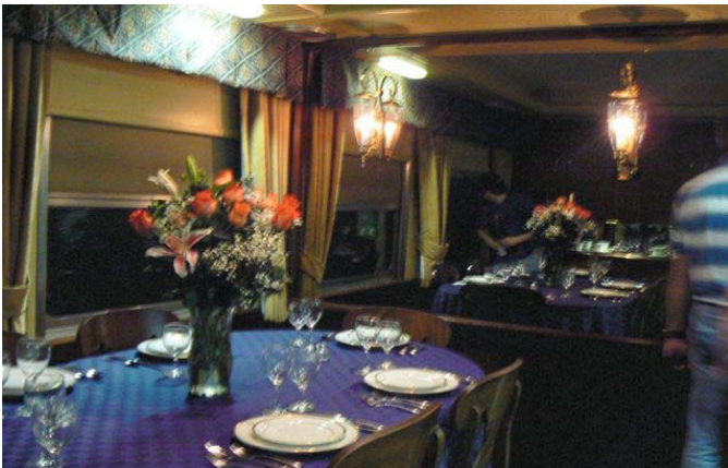
Louisville & Nashville Dining Car, Ohio river

Going to Suzhou I took the express and once it left the yard in Shanghai traveled at 350 km (218 MPH) on some very smooth overhead track until we enter the yard in Suzhou. On the way back to Shanghai took there local high speed train that makes stops along the way. Between station stops it went 238 km (147 mph) which was fast but at times it hit 297 km (184 mph). This train does not have the Business Class seats. After getting off in Shanghai which was the end of the line you could see employees turning the seats for the return trip. The trains are new and very clean and ride very smooth. You do not even feel it when you go over a switch. Wish the Acela Express could run at these speeds. Maybe some day.