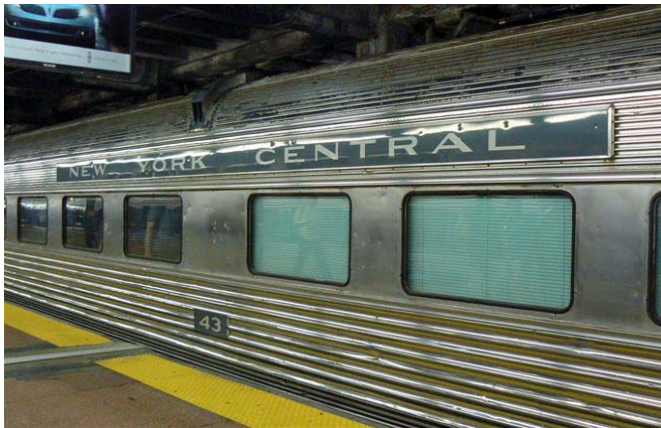
Tavern Lounge car #43

Below is the seating in the 2nd Class cars. As you can see they are 3 across on one side and 2 across on the other. The 1st class and 2nd class coach are just like the ones you would find on airplanes. I have now ridden in all classes.