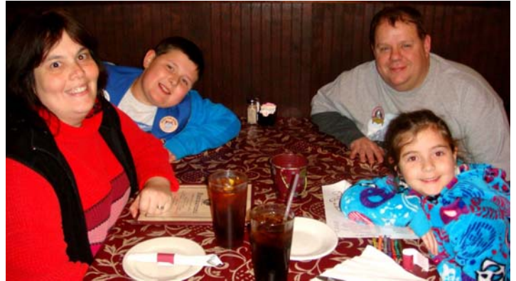
After a hard day at the train show on Saturday it was time to go out and have some pizza together. Here we are at Rocco's in Wilmington.