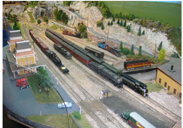
Above is a model of the North Conway Railroad Station, turntable and Roundhouse.