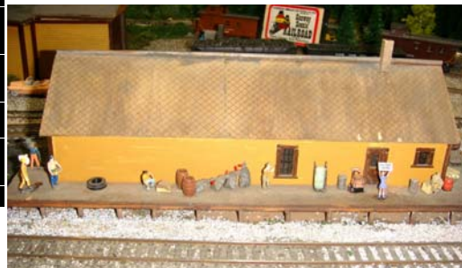
This is a model of the building where the North Conway Model Railroad Club layout is located. Entrance is thru the door on the right. Check it out next time you are in N. Conway.