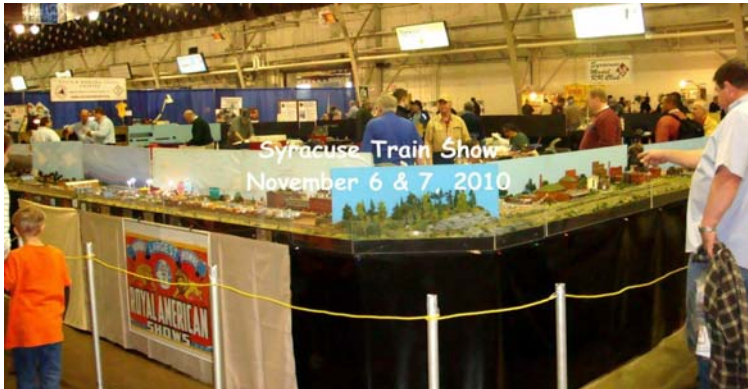
Above is one of the Ntrak layouts in building 1. Right is taken of building 2.