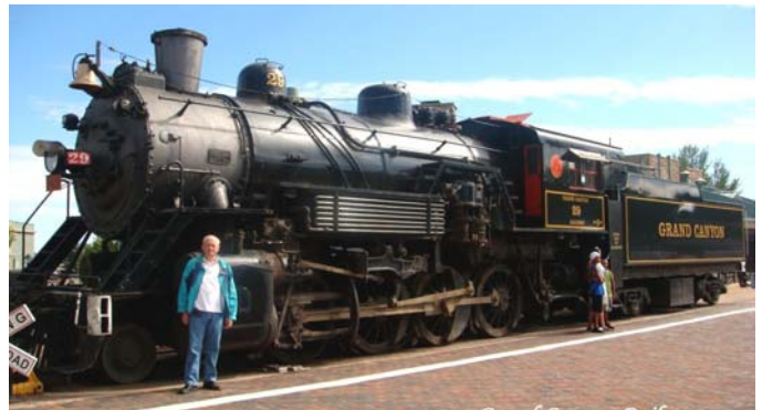
Above is the last steam engine to run the line.

In July I took a tour on the Canyons in the southwest. On this tour I got to ride on the Grand Canyon Railway. It runs from Williams, Arizona to the South Rim of the Grand Canyon. In the past they ran with steam, but today they use diesel. They say it was done to cut down on pollution and save on water. Maybe that was one of the reasons but I think the main reason was to save on diesel fuel. They say the steam locomotive used approximately 1,450 gallons of diesel fuel per day (round trip) to haul the typical train from Williams to the Grand Canyon South Rim and back. The diesel locomotives use approximately 550 gallons of diesel fuel per day to haul the same train the same distance with two locomotives, and 50 gallons for the generator in the power car. So switching from steam to diesel saves approximately 900 gallons per day. Good reason to switch from steam to diesel.