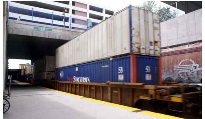
Some of the 150 double stacks. Below the helper engine at the rear as it passes thru the station and leaves.