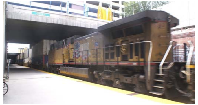
Second unit of the train.

I waited a 1/2 hour and a Union Pacific Double Stack train heading east came through. The train was about 150 cars long, there was 2 locomotives on the front and a rear pusher. I hope to be going back next year and I hope to catch some more trains.