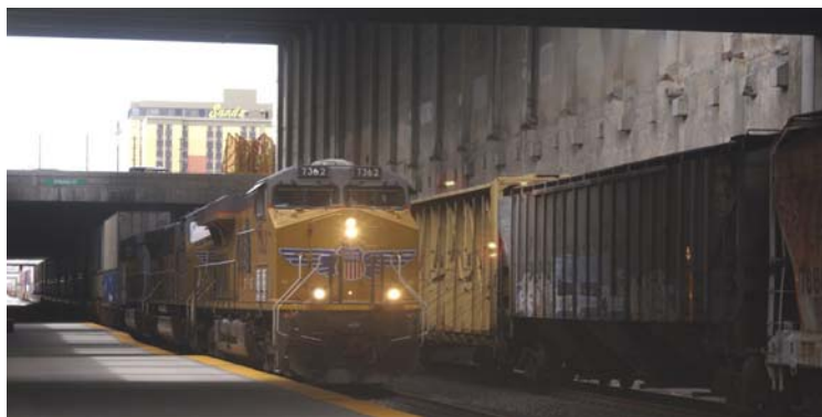
Union Pacific Double Stack as it enters the station in Reno,

For years the train would run down the main street in Reno. Until 2002, when the city decided to put the trains in the Trough. The trains now run below the city and there is no longer any delays for traffic. The Rail Access Corridor was started in 2002 and dedicated in 2006. It took 4 years to lower the track to below street level. The first train ran in 2006 through the New Rail Access Corridor. I was in Reno for the first time in May. It is billed as the Biggest Little City in the World. I took a walk from my hotel to the Amtrak Station.