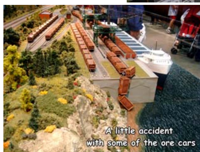
A little accident with some of the ore cars

Members from seven different N-Trak Clubs contributed to the making of the layout.