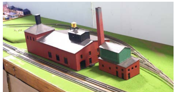
Steve Capers new module a work in progress. Great to see new modules.

The Bedford Boomers Club that hosted the event, thanked Northeast NTRAK for our participation. Many of the other clubs commented on how quickly we get set up and are operational... Attendance at the show was very good. There were over thirteen operating layouts at the show. They covered the range from N to G to 1/4 scale.. Outside they had a garden scale style layout and the live steam for kids & adults to ride on.. All in all it was a successful show.