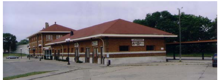
LaCrosse, WI AMTRAK Station (Formerly MILW - Chicago, Milwaukee, St. Paul & Pacific, later SOO) Built in 1926.