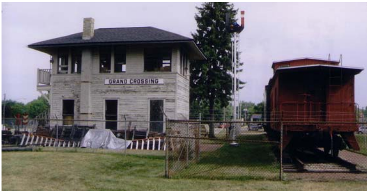
Historic Preservation of "Grand Crossing" tower, a caboose and a CBQ 4-6-4 Steam Engine. The tower guarded the crossing of the east-west MILW and CNW with the north-south CBQ several miles east of this site in Copeland Park, LaCrosse, WI.

The east-west MILW and CNW line crossed the north-south CBQ a few miles to the east in La Crosse. The place and its tower were named "Grand Crossing." The crossing is currently in use by CP, UP and AMTRAK (east-west) and BNSF (north-south). The tower was relocated to a park in north LaCrosse,