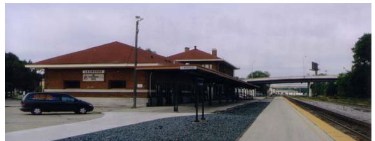
LaCrosse, WI AMTRAK Station, Track-side view.

Above photo shows the street side with the low, baggage/freight portion in the foreground (presently a BBQ diner) and the passenger area and offices in the 2-story section beyond. AMTRAK's "Empire Builder," with one train daily in each direction, stops here. We just missed seeing the westbound. The rail-side photo below shows the effect of reduced passenger traffic: the two concrete passenger platforms are separated by a ballast-filled strip which seems just wide enough to have been a siding. Further to the right in the photo are yard tracks running south and curving west to the river under the two roadway overpasses.