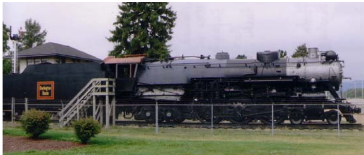
CBQ 4-6-4 Hudson No. 4000. Built by Baldwin in 1930. Named Aeolus (Keeper of the Winds).

along with the caboose and the CBQ 4-6-4 Hudson No. 4000. She was built by Baldwin in 1930, given the name Aeolus (Keeper of the Winds). The engine was standby power for the Burlington's Zephyr's. These several photos below, to me , more than justify the "WOW's" that we shouted on first sight of the tower and engine and more than a few silent "thanks you's" for the people involved with this preservation activity. (Background info is from the RR Atlas we use and various web sites). Reluctantly we left before noon to cross the Mississippi River into Minnesota and further adventures on I-90.