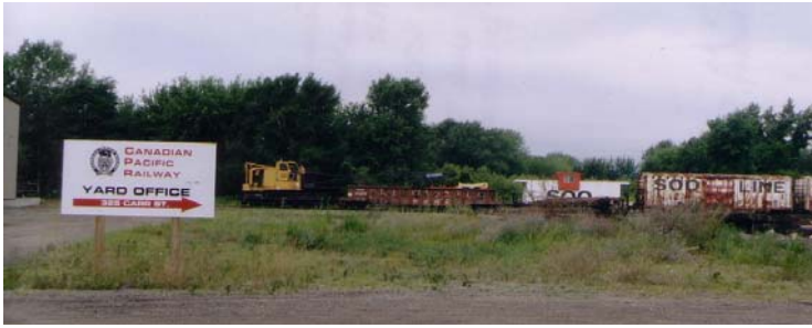
Canadian Pacific RR (CP) northeast of LaCrosse, WI RR Station. SOO is a subsidiary of CP. Work train in view waiting for orders.

A bit to the east of the station, the CP announces its Yard Office (photo). A SOO work train awaits orders in the background. Elsewhere we have seen SOO equipment fresh from the paint shop.