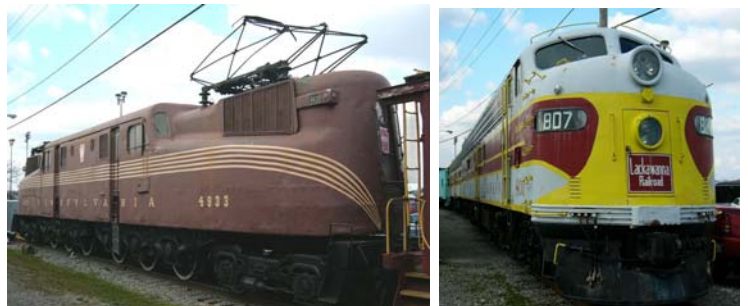
Above are some of the trains on display at the Railroad Museum located at the New York State Fairgrounds.