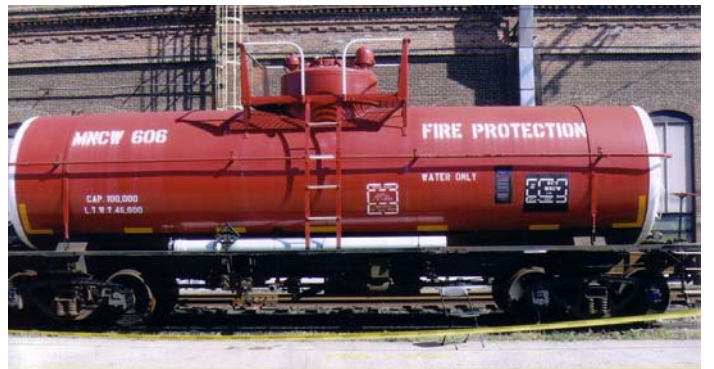
One of two water-filled tank cars in the Fire Protection Service of the MetroNorth Commuter Railroad. This one stationed at the Railroad Maintenance Facility in Croton-Harwau, NY on the former Hudson River NY Central mainline.

WOW! And then, when no one was looking, the tree would slowly return to the upright position ready to repeat the performance. WOW, again! A picture of Rich showing a bit of his module was printed in the May 2003 NE N-trak Newsletter. Rich Marko - a true innovator.