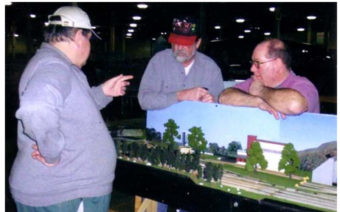
Members from Valley Ntrak.