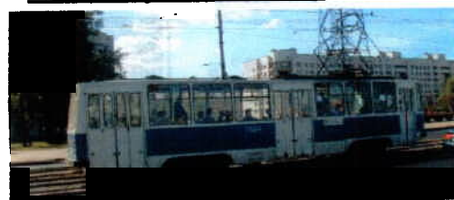
One of the many trolley's in St. Petersburg, Russia, August 2002

On my visit to Russia I had a chance to see some of the public transportation systems in Moscow and St. Petersburg. Their Metro system has the most frequent trains I know of in any city. during rush hour the subway trains run every 45 seconds. In non-rush hour they are every two minutes. There stations are museums. Moscow has a very large